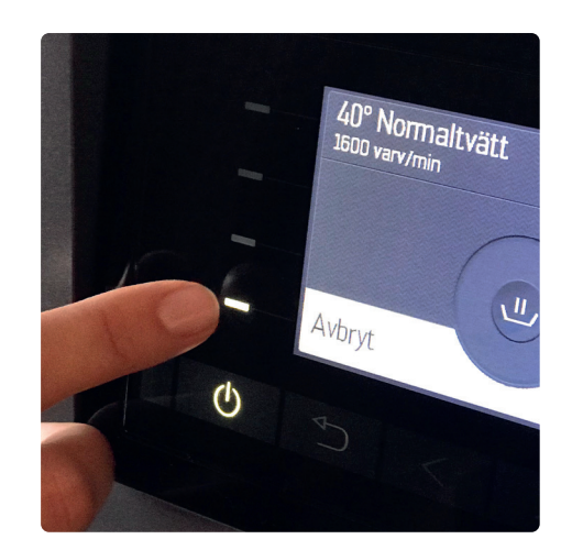
Stop in advance Press the light bar next to 'Cancel' and hold until 'End' is i displayed.