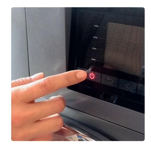
1. Start the display Press the On/Off button to start the display.