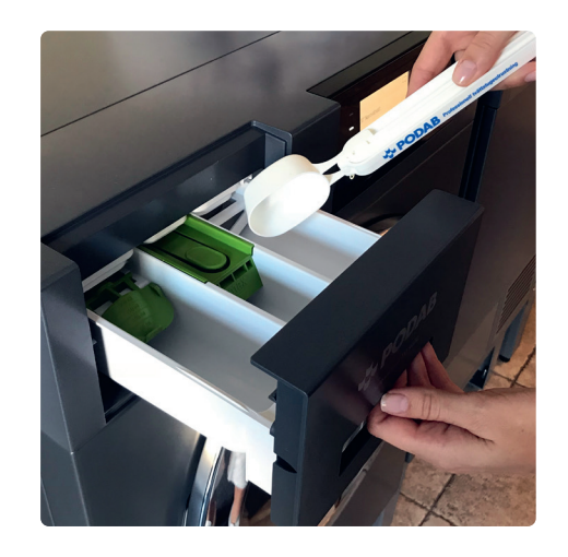
Prewash If prewash is selected, add detergent in the right compartment.