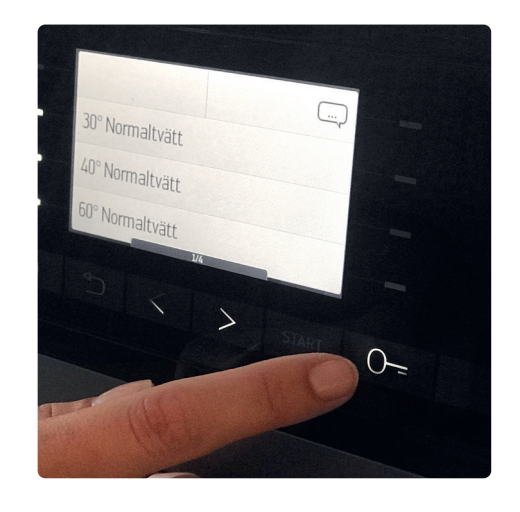
2. Open the door Press the key symbol to open the door.