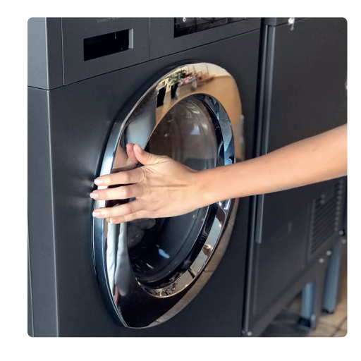
4. Close Close the door.