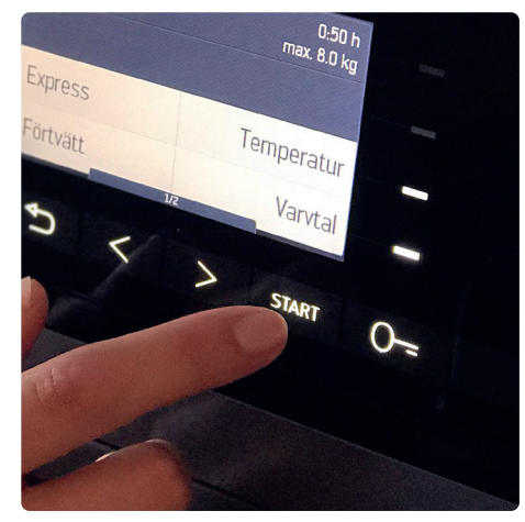
7. Start Press the start button.