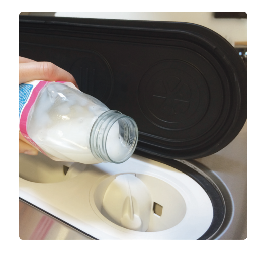
4. Add softener If softener is used, pour it into the Compartment.