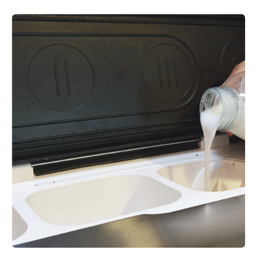
3b. Add liquid If liquid detergent is used, pour it into the •• -compartment.