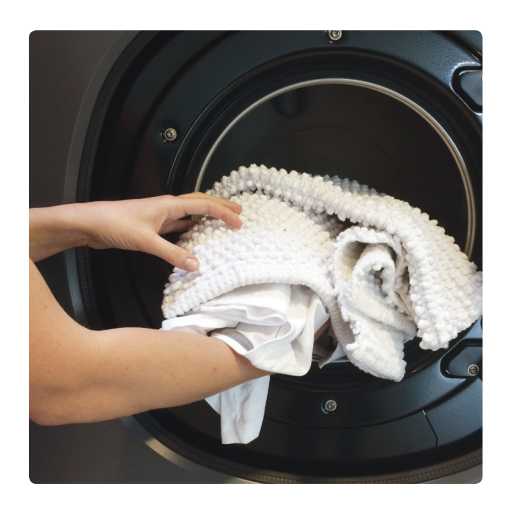
7. Unload When the wash cycle is finished, unload the laundry.