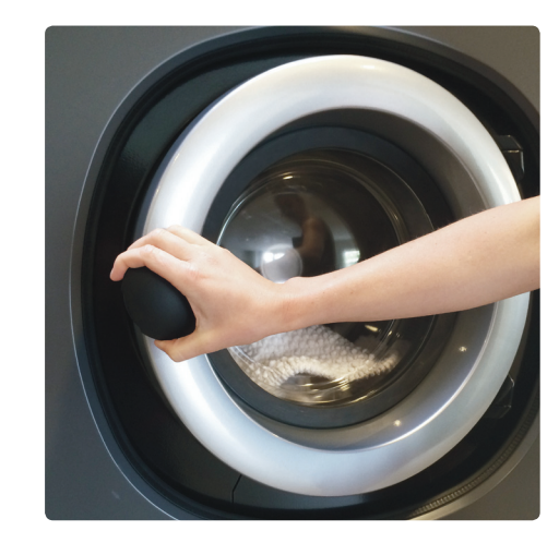
2. Close Close the door. Turn the knob.