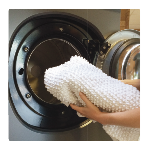
1. Load Load the washing machine.