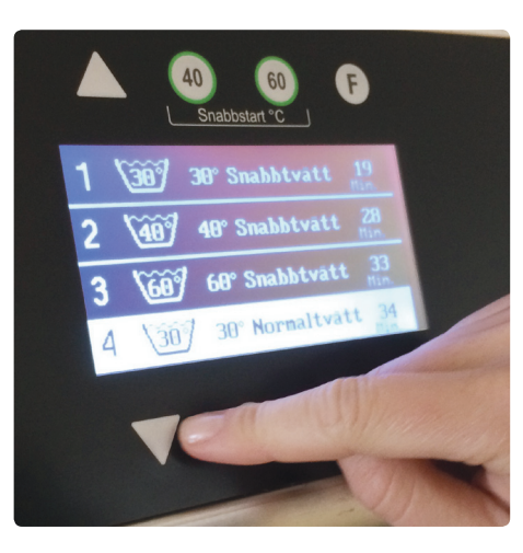
5. Choose program Choose program with the arrows.