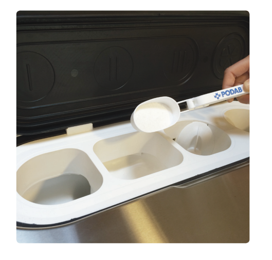
3a. Add powder If powder detergent is used, pour it into the • -compartment.